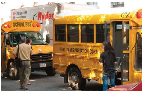
Step-by-Step Stop-Idling Guide