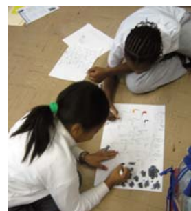
AFSZ Lesson Plans