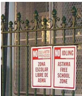
No Idling Signs