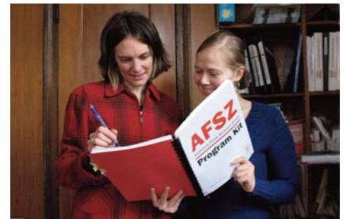
AFSZ Program Kit