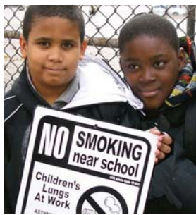
No Smoking Signs